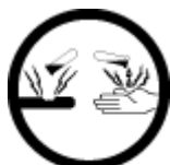
E - Corrosive