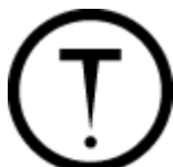
D2B - Toxic

D2B - Toxic materials, Eye irritation Class E : Corrosive to aluminum. Not corrosive to animal skin or carbon steel.